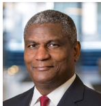
Rodney E. Slater