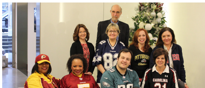
Jeans and Jersey Day, Washington DC office