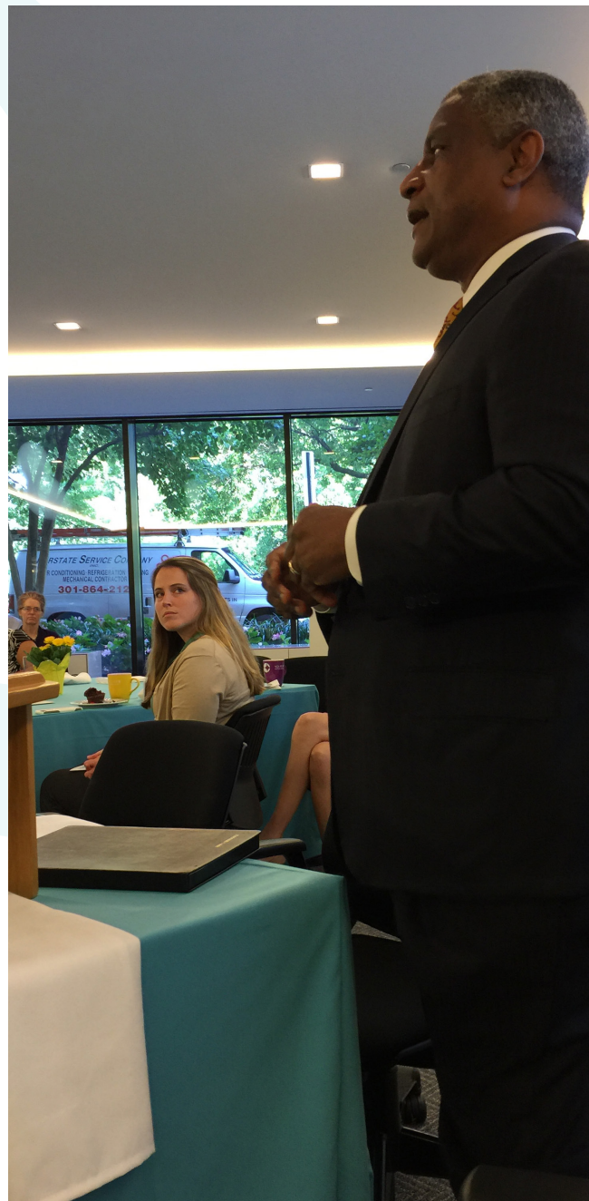
Foundation chairman Rodney Slater addresses the 2017 Fellows' breakfast.