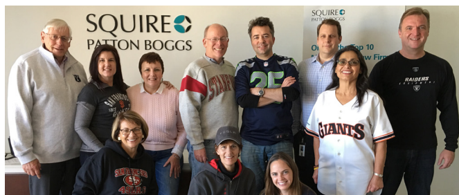
Jeans and Jersey Day, San Francisco office