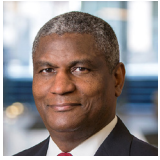
Rodney E. Slater Chairman